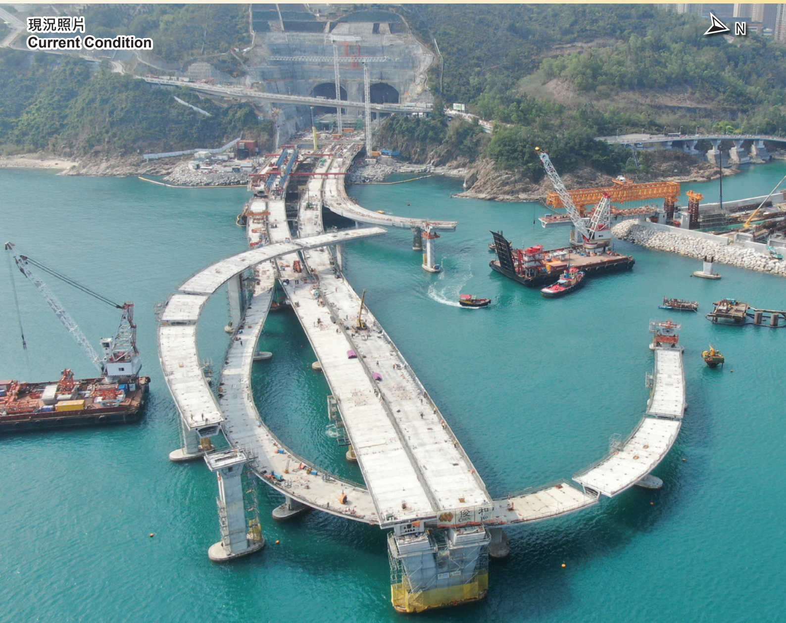
現況照片 Current Condition

Welcome to the seventeenth issue of Tseung Kwan O–Lam Tin Tunnel (TKO–LTT) Newsletter (Construction). This issue introduces the construction progress at Junk Bay, Southern Footbridge in Tseung Kwan O (TKO) and other relevant information about the project.