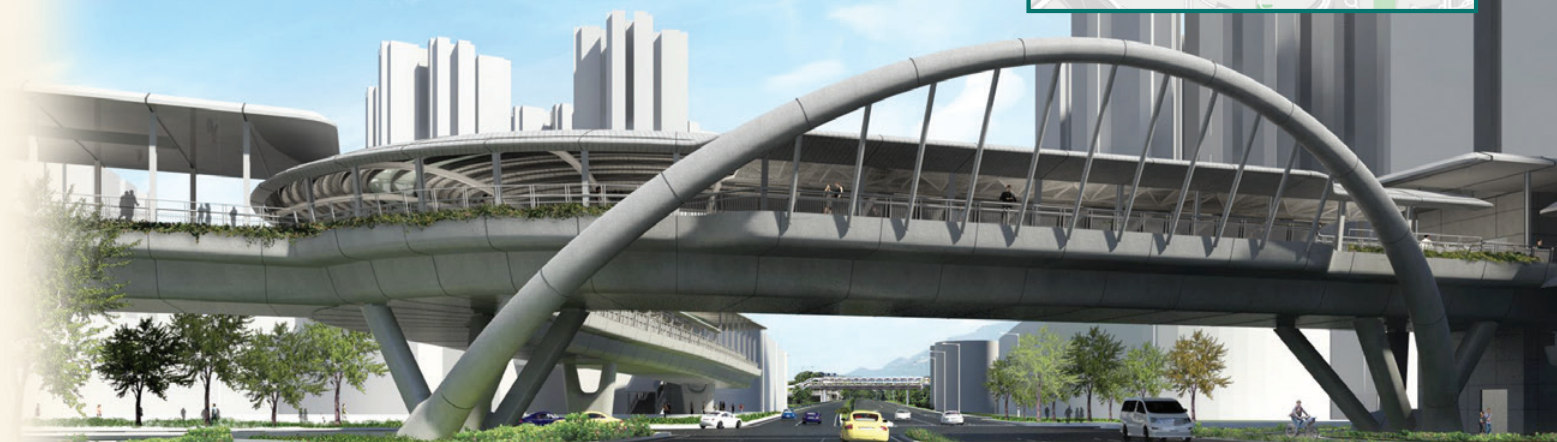
建造行人橋橋面 Construction of bridge deck

Road P2/D4 and Associated Works include the construction of an approximate 95m long and 10m wide covered footbridge cum cycle track (namely the Southern Footbridge) crossing Chui Ling Road, which connects the Tiu Keng Leng Sports Centre, Po Yap Road and Chui Ling Road. It provides convenient and safe crossing facilities for pedestrians and cyclists. The construction of bridge deck and lift shaft, and road widening are now in progress. The falsework for footbridge construction across Chui Ling Road was completed.