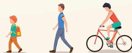
南行人橋示意圖 Illustration of Southern Footbridge